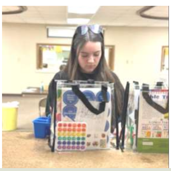
Children's church activity bags get a new look!