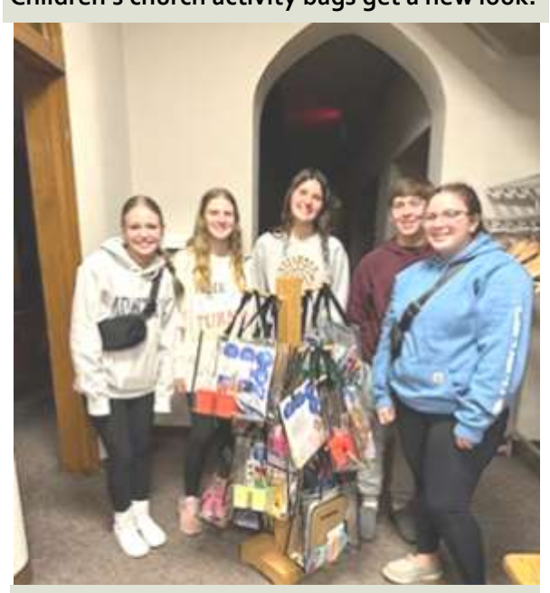
Thank you to the high school youth group for updating the children's church activity bags, they look great and our little ones will enjoy checking them out!