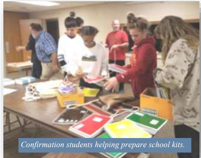
Confirmation students helping prepare school kits.

Thank you to all who helped prepare quilts & kits which were sent to the warehouse. The fall totals are: 134 quilts, 143 school kits, baby care kits 8, fabric kits 11. Quilt tying will resume January 7, 2019.