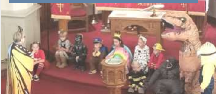
The Sunday School students and Pastor :) had fun wearing their costumes to worship on the Sunday before Halloween.

Sunday, December 16 - Christmas Program at 9:00 am Worship Service, NO SUNDAY SCHOOL Please join us for Christmas cookies, hot cocoa and coffee, in the lower level of the church following the program.