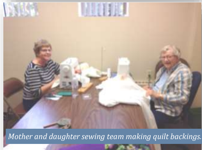
Mother and daughter sewing team making quilt backings.