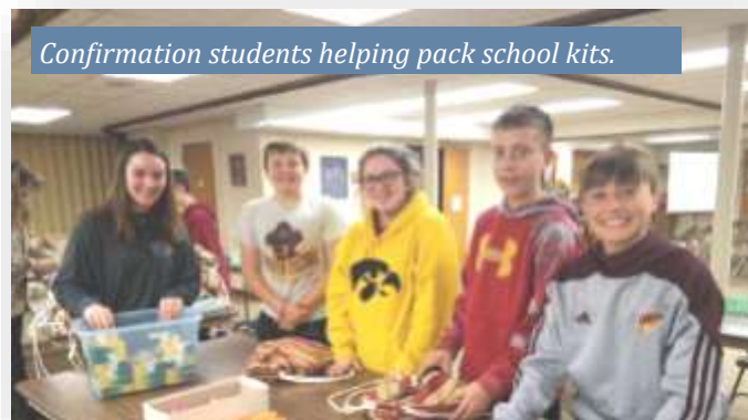
Confirmation students helping pack school kits.

Confirmation class meets Wednesdays at 6:15 pm, in the lower level.