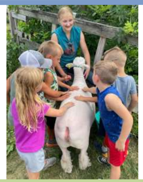
A big thank you to all of our Vacation Bible School volunteers and donations! We had 50 students participate this year.