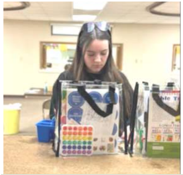
Children's church activity bags get a new look!

- Kids will sing in church May 7 th . This will be our last day of Sunday School.