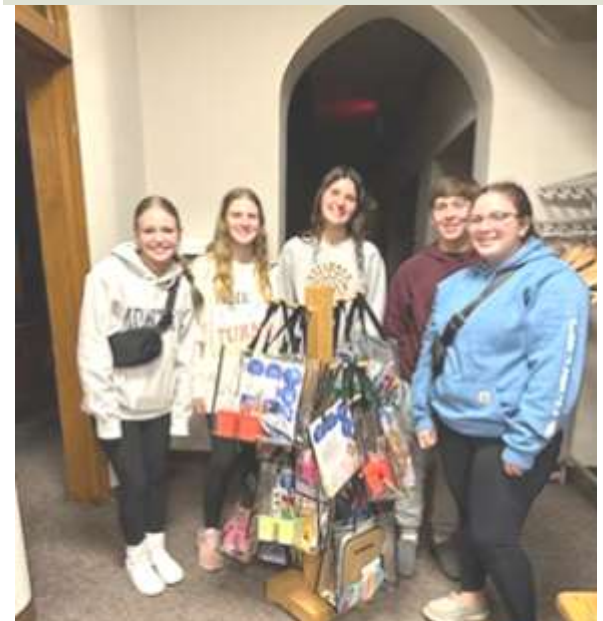
Thank you to the high school youth group for updating the children's church activity bags, they look great and our little ones will enjoy checking them out!