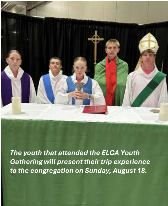
The youth that attended the ELCA Youth Gathering will present their trip experience to the congregation on Sunday, August 18.

Blessings to all of you on the last legs of summer!