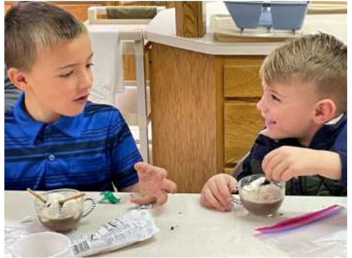
During Christmas program practice the children found time to share hot cocoa and build marshmallow snowmen together.

Thank you for sending your child(ren) to Sunday School! We have started preparing for our program. Costumes were tried on. Some roles confirmed - thank you to the upperclassman for volunteering their time to support our youngest members! We prepared our Jesse tree - thank you to those who hammered and worked so hard preparing our ornaments! We had some hot