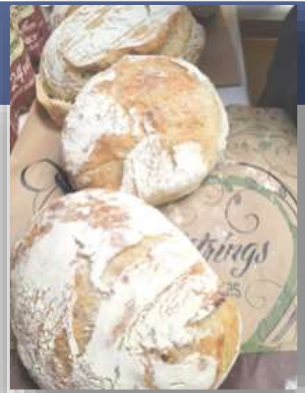
The ELCA Youth Gathering students served up a delicious spaghetti lunch, complete with homemade bread, after the Annual meeting.