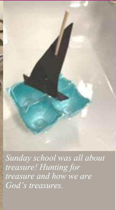
Sunday school was all about treasure! Hunting for treasure and how we are God's treasures.