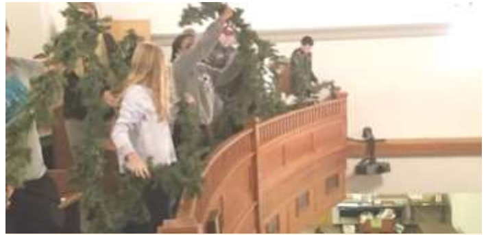
The middle & high school youth did a great job Hanging the Greens!

The brochures for summer camp are available on the table in front of the office.