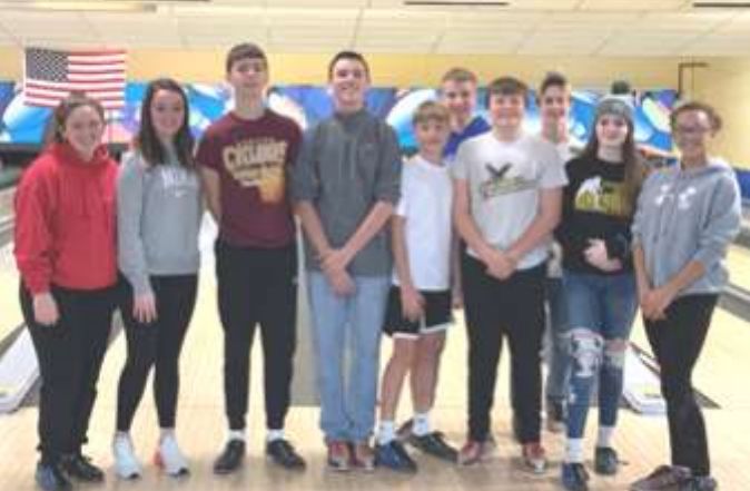
Cosmic Bowling was a blast for this group of youth (last year's Lenten Supper servers)