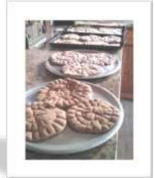
Finished product :)